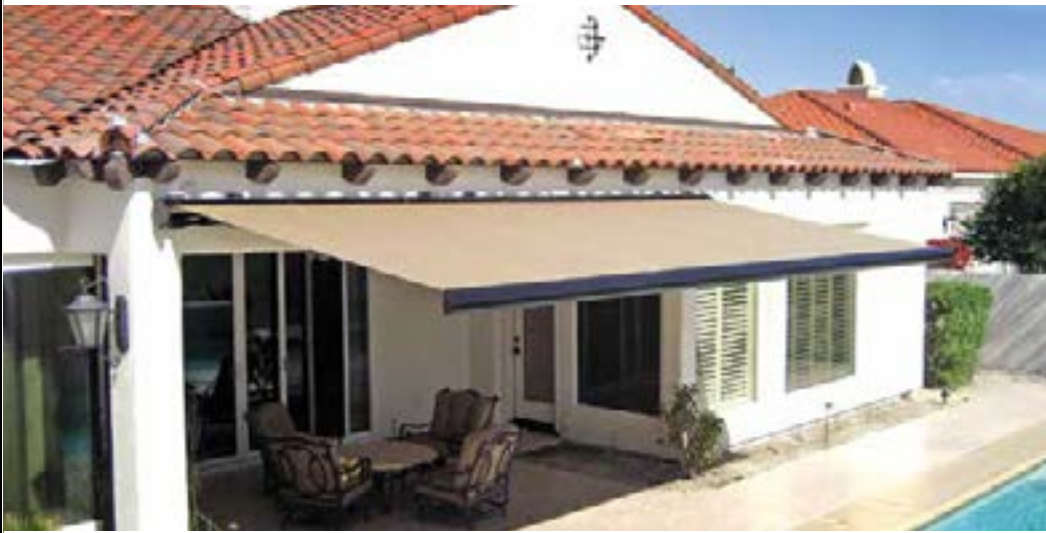
Series G250 shown in OPEN position